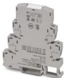
Power terminal block, for the input of up to four potentials, for mounting on NS 35/7.5

Please be informed that the data shown in this PDF Document is generated from our Online Catalog. Please find the complete data in the user's documentation. Our General Terms of Use for Downloads are valid ( http://phoenixcontact.com/download )