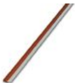
Continuous plug-in bridge, length: 500 mm, color: red

Continuous plug-in bridge - FBST 500-PLC RD - 2966786