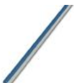
Continuous plug-in bridge, length: 500 mm, color: blue

Continuous plug-in bridge - FBST 500-PLC BU - 2966692