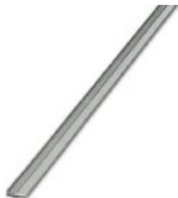
Continuous plug-in bridge, length: 500 mm, color: brown

Please be informed that the data shown in this PDF Document is generated from our Online Catalog. Please find the complete data in the user's documentation. Our General Terms of Use for Downloads are valid ( http://phoenixcontact.com/download )