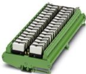
Varioface output module, with 32 miniature relays, 1 PDT, plugged, for 24 V DC (incl. relay)

Please be informed that the data shown in this PDF Document is generated from our Online Catalog. Please find the complete data in the user's documentation. Our General Terms of Use for Downloads are valid ( http://phoenixcontact.com/download )