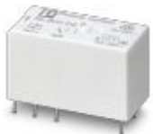
Plug-in miniature power relay, with power contact for high continuous currents, 1 PDT, input voltage 24 V DC

Single relay - REL-MR- 24DC/21HC - 2961312