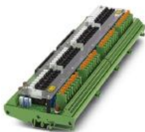
VARIOFACE output module, 32 channels for Yokogawa ADV 551, ADV 561 output modules.

Please be informed that the data shown in this PDF Document is generated from our Online Catalog. Please find the complete data in the user's documentation. Our General Terms of Use for Downloads are valid ( http://phoenixcontact.com/download )