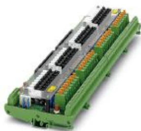
VARIOFACE output module, 32 channels for Yokogawa ADV 551, ADV 561 output modules.

Please be informed that the data shown in this PDF Document is generated from our Online Catalog. Please find the complete data in the user's documentation. Our General Terms of Use for Downloads are valid ( http://phoenixcontact.com/download )