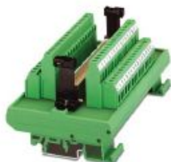
VARIOFACE module, for IEC 603/DIN 41612 connector, type C, 64-pos., a, c components mounted, with male connector, cable housing with screw interlock

Please be informed that the data shown in this PDF Document is generated from our Online Catalog. Please find the complete data in the user's documentation. Our General Terms of Use for Downloads are valid ( http://phoenixcontact.com/download )