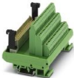
VARIOFACE module, for IEC 603/DIN 41612 connector, type F, 48-pos., z, b, d components mounted, with male connector, cable housing with screw interlock

Please be informed that the data shown in this PDF Document is generated from our Online Catalog. Please find the complete data in the user's documentation. Our General Terms of Use for Downloads are valid ( http://phoenixcontact.com/download )