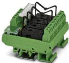
VARIOFACE module, for 4 plug-in miniature relays or miniature optocouplers, with LED, 24 V AC/DC input voltage

Please be informed that the data shown in this PDF Document is generated from our Online Catalog. Please find the complete data in the user's documentation. Our General Terms of Use for Downloads are valid ( http://phoenixcontact.com/download )