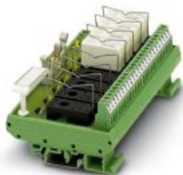
VARIOFACE module, for 8 plug-in miniature relays or miniature optocouplers, with LED, 24 V DC input voltage

Please be informed that the data shown in this PDF Document is generated from our Online Catalog. Please find the complete data in the user's documentation. Our General Terms of Use for Downloads are valid ( http://phoenixcontact.com/download )