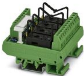
VARIOFACE module, for 4 plug-in miniature relays or miniature optocouplers, with LED, 24 V DC input voltage

Please be informed that the data shown in this PDF Document is generated from our Online Catalog. Please find the complete data in the user's documentation. Our General Terms of Use for Downloads are valid ( http://phoenixcontact.com/download )