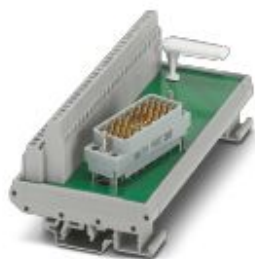
Interface module, connection 1: Screw connection, connection 2: ELCO connector 1x 56-position (Pin strip type 8016, left)

Please be informed that the data shown in this PDF Document is generated from our Online Catalog. Please find the complete data in the user's documentation. Our General Terms of Use for Downloads are valid ( http://phoenixcontact.com/download )