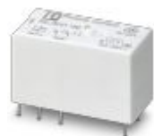
Plug-in miniature power relay, with power contact, 2 PDTs, input voltage 24 V DC

Single relay - REL-MR- 24DC/21-21 - 2961192