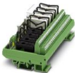
VARIOFACE output module, with plug-in bases for 8 miniature relays, with 2 PDTs each (without relays), for 24 V DC

Please be informed that the data shown in this PDF Document is generated from our Online Catalog. Please find the complete data in the user's documentation. Our General Terms of Use for Downloads are valid ( http://phoenixcontact.com/download )