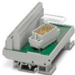
Interface module, connection 1: Screw connection, connection 2: ELCO connector 1x 38-position (Pin strip type 8016, left)

Please be informed that the data shown in this PDF Document is generated from our Online Catalog. Please find the complete data in the user's documentation. Our General Terms of Use for Downloads are valid ( http://phoenixcontact.com/download )