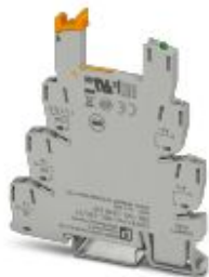
6.2 mm PLC basic terminal block with screw connection, without relay or solid-state relay, for mounting on DIN rail NS 35/7,5, 1 PDT, input voltage 5 V DC

Please be informed that the data shown in this PDF Document is generated from our Online Catalog. Please find the complete data in the user's documentation. Our General Terms of Use for Downloads are valid ( http://phoenixcontact.com/download )