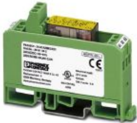
Universal safety relay with forcibly guided contacts, two PDT contacts, for U_N 120 V AC/DC

Please be informed that the data shown in this PDF Document is generated from our Online Catalog. Please find the complete data in the user's documentation. Our General Terms of Use for Downloads are valid ( http://phoenixcontact.com/download )