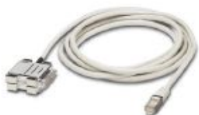
The figure shows a version for Siemens, Heidenhain control system

Cable adapter for PSR over-speed safety relays (PSR-RSM4 and PSR-MM30), 9/8-pos., cable length: 2.5 m, for controller: Lenze