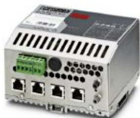
Proxy for PROFINET-RT, G4 functionality, INTERBUS proxy for fiber optics with integrated 4-port switch

Please be informed that the data shown in this PDF Document is generated from our Online Catalog. Please find the complete data in the user's documentation. Our General Terms of Use for Downloads are valid ( http://phoenixcontact.com/download )