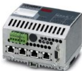
Proxy for PROFINET-RT-IRT, G4 functionality, INTERBUS proxy with integrated 4-port switch

Please be informed that the data shown in this PDF Document is generated from our Online Catalog. Please find the complete data in the user's documentation. Our General Terms of Use for Downloads are valid ( http://phoenixcontact.com/download )