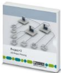
Configuration tool for Inline and Axioline F-I/O stations (free download)

Please be informed that the data shown in this PDF Document is generated from our Online Catalog. Please find the complete data in the user's documentation. Our General Terms of Use for Downloads are valid ( http://phoenixcontact.com/download )