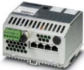
Ethernet Smart Managed Compact Switch with four 10/100 Mbps RJ45 ports, PROFINET mode (default)

Please be informed that the data shown in this PDF Document is generated from our Online Catalog. Please find the complete data in the user's documentation. Our General Terms of Use for Downloads are valid ( http://phoenixcontact.com/download )