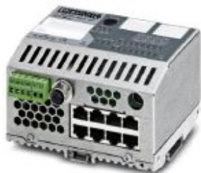
Ethernet Smart Managed Compact Switch with eight 10/100 Mbps RJ45 ports

Please be informed that the data shown in this PDF Document is generated from our Online Catalog. Please find the complete data in the user's documentation. Our General Terms of Use for Downloads are valid ( http://phoenixcontact.com/download )