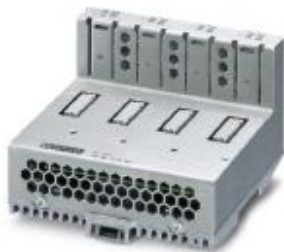
Extension module for the FL SWITCH GHS... Gigabit Modular Switch, extension by up to 8 Ethernet ports

Please be informed that the data shown in this PDF Document is generated from our Online Catalog. Please find the complete data in the user's documentation. Our General Terms of Use for Downloads are valid ( http://phoenixcontact.com/download )