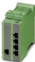
Ethernet Lean Managed Switch with five 10/100 Mbps RJ45 ports, preconfigured for EtherNet/IP™

Please be informed that the data shown in this PDF Document is generated from our Online Catalog. Please find the complete data in the user's documentation. Our General Terms of Use for Downloads are valid ( http://phoenixcontact.com/download )