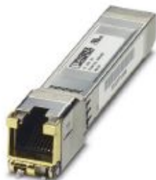
Gigabit SFP module for transmission up to 100 m.

Please be informed that the data shown in this PDF Document is generated from our Online Catalog. Please find the complete data in the user's documentation. Our General Terms of Use for Downloads are valid ( http://phoenixcontact.com/download )