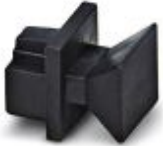
Dust protection caps for RJ45 socket

Dust protection - FL RJ45 PROTECT CAP - 2832991