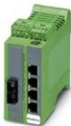
Ethernet Lean Managed Switch with four 10/100 Mbps RJ45 ports and one 100 Mbps FX-SC multi-mode port, preconfigured for EtherNet/IP™

Please be informed that the data shown in this PDF Document is generated from our Online Catalog. Please find the complete data in the user's documentation. Our General Terms of Use for Downloads are valid ( http://phoenixcontact.com/download )