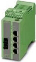
Ethernet Lean Managed Switch with four 10/100 Mbps RJ45 ports and one 100 Mbps FX-ST single-mode port

Please be informed that the data shown in this PDF Document is generated from our Online Catalog. Please find the complete data in the user's documentation. Our General Terms of Use for Downloads are valid ( http://phoenixcontact.com/download )