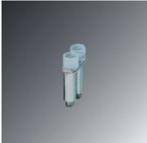
Fixed bridge, pitch: 5 mm, number of positions: 2, color: silver

Please be informed that the data shown in this PDF Document is generated from our Online Catalog. Please find the complete data in the user's documentation. Our General Terms of Use for Downloads are valid ( http://phoenixcontact.com/download )