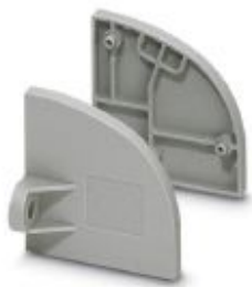
Flange, number of positions: 0, color: gray

Please be informed that the data shown in this PDF Document is generated from our Online Catalog. Please find the complete data in the user's documentation. Our General Terms of Use for Downloads are valid ( http://phoenixcontact.com/download )