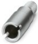
Female test connector, color: silver

Female test connector - PSB 4/7/6 - 0303299