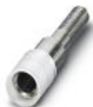
Female test connector, color: transparent

Female test connector - PSBJ 4/15/6 FARBLOS - 0303419