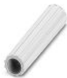
Insulating sleeve, color: white