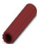
Insulating sleeve, color: red