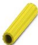
Insulating sleeve, color: yellow