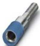
Female test connector, color: blue

Female test connector - PSBJ 4/15/6 BU - 0303354