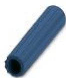
Insulating sleeve, color: blue