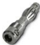
Test plugs, color: silver