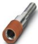
Female test connector, color: red

Female test connector - PSBJ 4/15/6 RD - 0303325