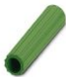
Insulating sleeve, color: green