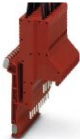
Test plugs, color: red

Please be informed that the data shown in this PDF Document is generated from our Online Catalog. Please find the complete data in the user's documentation. Our General Terms of Use for Downloads are valid ( http://phoenixcontact.com/download )