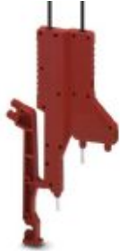
Test plugs, color: red

Please be informed that the data shown in this PDF Document is generated from our Online Catalog. Please find the complete data in the user's documentation. Our General Terms of Use for Downloads are valid ( http://phoenixcontact.com/download )