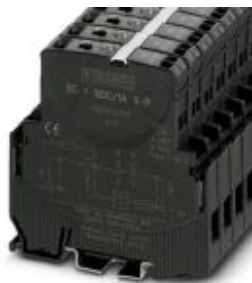
Electronic circuit breaker, on/off control input, nominal current: 2 A

Please be informed that the data shown in this PDF Document is generated from our Online Catalog. Please find the complete data in the user's documentation. Our General Terms of Use for Downloads are valid ( http://phoenixcontact.com/download )