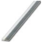
Continuous plug-in bridge, mounting type: Plug-in mounting, Color: gray

Continuous plug-in bridge - FBST 500 TMC-N GY - 0901028