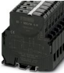
Electronic circuit breaker, reset input and status output, nominal current: 1 A

Please be informed that the data shown in this PDF Document is generated from our Online Catalog. Please find the complete data in the user's documentation. Our General Terms of Use for Downloads are valid ( http://phoenixcontact.com/download )