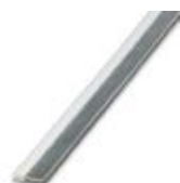
Continuous plug-in bridge, mounting type: Plug-in mounting, Color: gray

Continuous plug-in bridge - FBST 500 TMC-N GY - 0901028