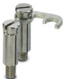
Switching jumper, number of positions: 2, color: silver

Please be informed that the data shown in this PDF Document is generated from our Online Catalog. Please find the complete data in the user's documentation. Our General Terms of Use for Downloads are valid ( http://phoenixcontact.com/download )