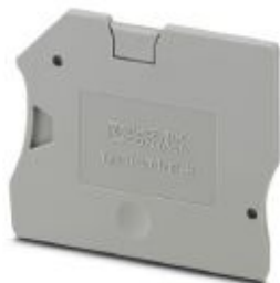
End cover, length: 49.8 mm, width: 2.2 mm, color: gray

Please be informed that the data shown in this PDF Document is generated from our Online Catalog. Please find the complete data in the user's documentation. Our General Terms of Use for Downloads are valid ( http://phoenixcontact.com/download )