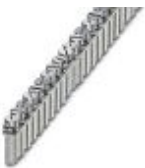
Fixed bridge, pitch: 5 mm, number of positions: 80, color: silver