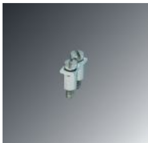
Fixed bridge, number of positions: 2, color: silver

Please be informed that the data shown in this PDF Document is generated from our Online Catalog. Please find the complete data in the user's documentation. Our General Terms of Use for Downloads are valid ( http://phoenixcontact.com/download )