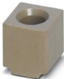
Bridge bar isolator

Please be informed that the data shown in this PDF Document is generated from our Online Catalog. Please find the complete data in the user's documentation. Our General Terms of Use for Downloads are valid ( http://phoenixcontact.com/download )