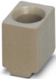
Bridge bar isolator

Please be informed that the data shown in this PDF Document is generated from our Online Catalog. Please find the complete data in the user's documentation. Our General Terms of Use for Downloads are valid ( http://phoenixcontact.com/download )