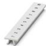
Zack marker strip, Strip, white, labeled, can be labeled with: CMS-P1-PLOTTER, printed horizontally: consecutive numbers 1 ... 10, 11 ... 20, etc. up to 491 ... 500, mounting type: snap into tall marker groove, for terminal block width: 6.2 mm, lettering field size: 6.15 x 10.5 mm, Number of individual labels: 10

Zack marker strip - ZB 6,LGS:FORTL.ZAHLEN - 1051016