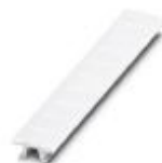
Zack marker strip, can be ordered: Strip, white, labeled according to customer specifications, mounting type: snap into tall marker groove, for terminal block width: 6.2 mm, lettering field size: 6.15 x 10.5 mm, Number of individual labels: 10

Zack marker strip - ZB 6,LGS:FORTL.ZAHLEN - 1051016