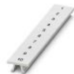
Zack marker strip, Strip, white, labeled, can be labeled with: CMS-P1-PLOTTER, Printed vertically: consecutive numbers 1 ... 10, 11 ... 20, etc. up to 491 ... 500, mounting type: snap into tall marker groove, for terminal block width: 6.2 mm, lettering field size: 6.15 x 10.5 mm, Number of individual labels: 10

Zack marker strip - ZB 6,QR:FORTL.ZAHLEN - 1051029