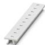
Zack marker strip, Strip, white, labeled, can be labeled with: CMS-P1-PLOTTER, printed horizontally: Identical numbers 1 or 2, etc. up to 100, mounting type: snap into tall marker groove, for terminal block width: 6.2 mm, lettering field size: 6.15 x 10.5 mm, Number of individual labels: 10

Zack marker strip - ZB 6,LGS:GLEICHE ZAHLEN - 1051032