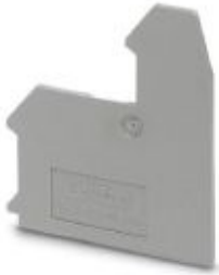
End cover, length: 47.5 mm, width: 1.5 mm, height: 58.5 mm, color: gray

Please be informed that the data shown in this PDF Document is generated from our Online Catalog. Please find the complete data in the user's documentation. Our General Terms of Use for Downloads are valid ( http://phoenixcontact.com/download )