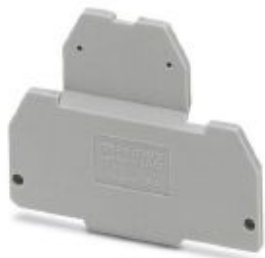
End cover, length: 44.2 mm, width: 4 mm, height: 34.6 mm, color: gray

Please be informed that the data shown in this PDF Document is generated from our Online Catalog. Please find the complete data in the user's documentation. Our General Terms of Use for Downloads are valid ( http://phoenixcontact.com/download )