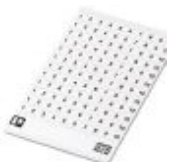
Marker card, Card, can be ordered: by card, white, labeled according to customer specifications, mounting type: adhesive, for terminal block width: 4.15 mm, lettering field size: continuous x 3.8#mm

Marker card - SK 3,8 REEL P4,15 WH CUS - 0825990