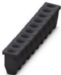
Insulating sleeve, color: black

Please be informed that the data shown in this PDF Document is generated from our Online Catalog. Please find the complete data in the user's documentation. Our General Terms of Use for Downloads are valid ( http://phoenixcontact.com/download )