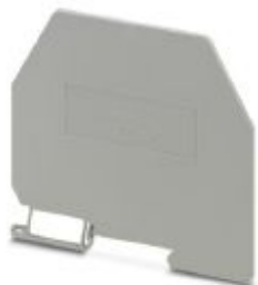
Partition plate, length: 99 mm, width: 2 mm, height: 90 mm, color: gray

Please be informed that the data shown in this PDF Document is generated from our Online Catalog. Please find the complete data in the user's documentation. Our General Terms of Use for Downloads are valid ( http://phoenixcontact.com/download )