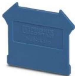
End cover, length: 42.5 mm, width: 1.8 mm, height: 47 mm, color: blue

Please be informed that the data shown in this PDF Document is generated from our Online Catalog. Please find the complete data in the user's documentation. Our General Terms of Use for Downloads are valid ( http://phoenixcontact.com/download )