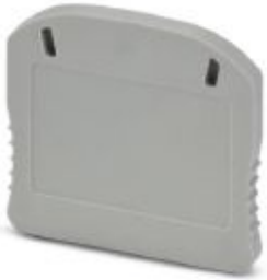
End cover, for use in DIN rail mounting, length: 19.9 mm, width: 2.2 mm, height: 17.7 mm, color: gray

Please be informed that the data shown in this PDF Document is generated from our Online Catalog. Please find the complete data in the user's documentation. Our General Terms of Use for Downloads are valid ( http://phoenixcontact.com/download )