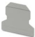
Partition plate, length: 56 mm, width: 1.5 mm, height: 45.7 mm, color: gray