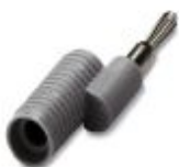
Reducing plug, color: gray